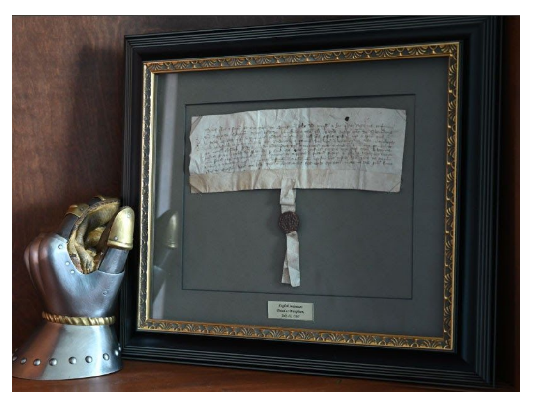
An original 14th century indenture displayed in a picture frame

note - We understand that people may want to display certain pieces that offer tremendous educational value but may be too fragile or valuable to allow public handling. In an effort to avoid using pseudo-historical methods of display that may cause educational confusion, we believe a simple modern display case is the best solution to make it clear to the public that certain objects are off limits to handling while having the least disruptive effect on the overall educational and historical atmosphere of the camps.